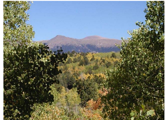
Pikes Peak Views