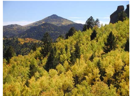
Mountain Splendor All Directions!