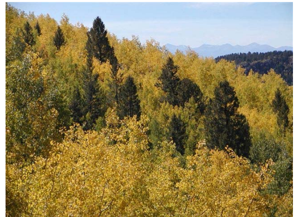
Sangre Views & Rich Colors of Green & Gold