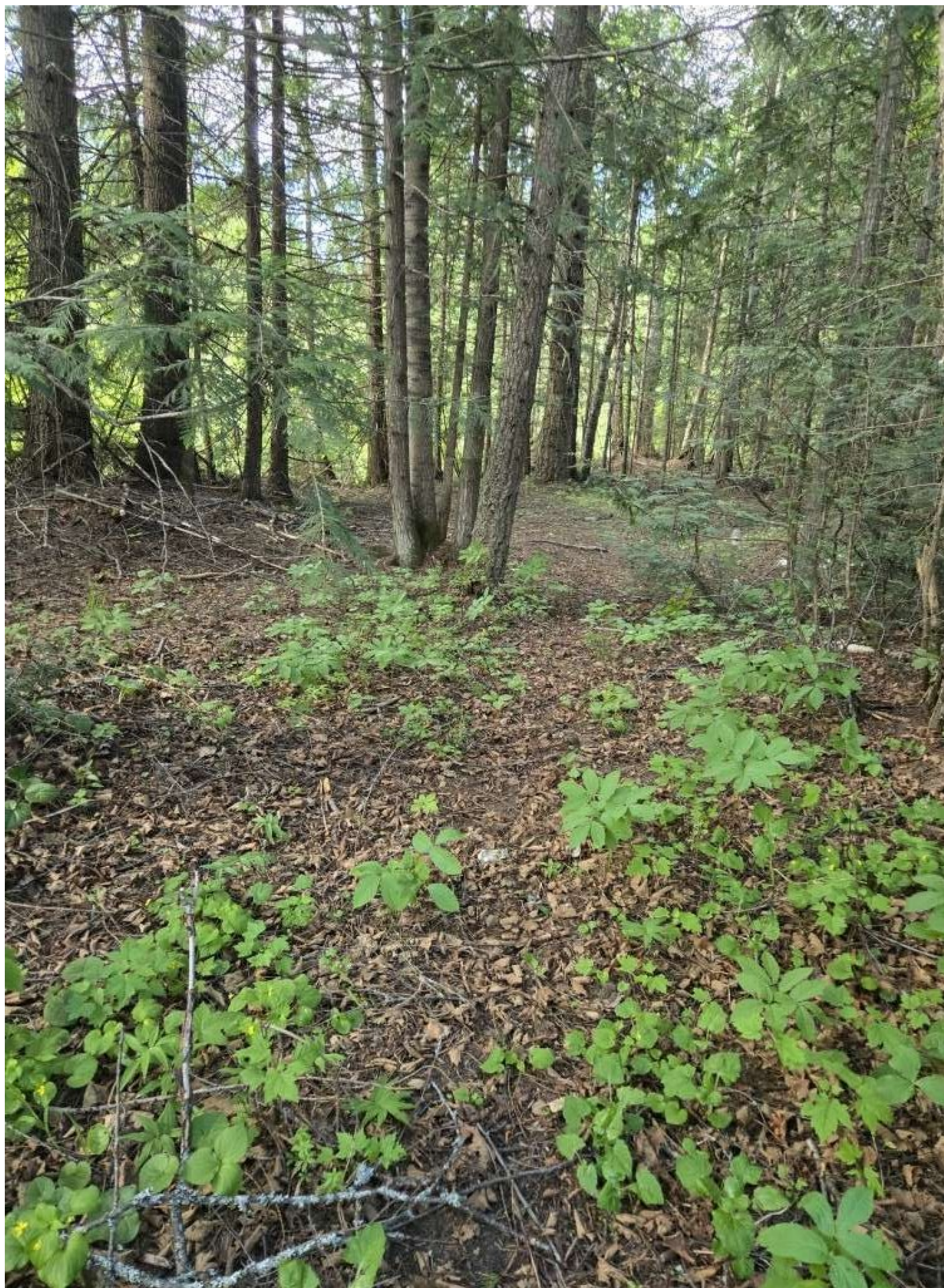
Harvey Creek and Sullivan Lake, Pend Oreille County, Washington, 18.45 Acres